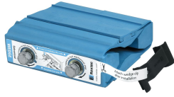
Wedge et Wedgekit